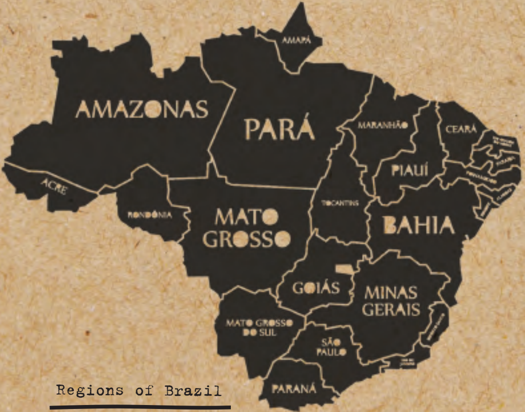
Regions of Brazil

Another Viva Brazil twist on a classic, we've taken the Sangria recipe and added some Samba spirit, using white rum and mango juice as well as the red wine and orange.